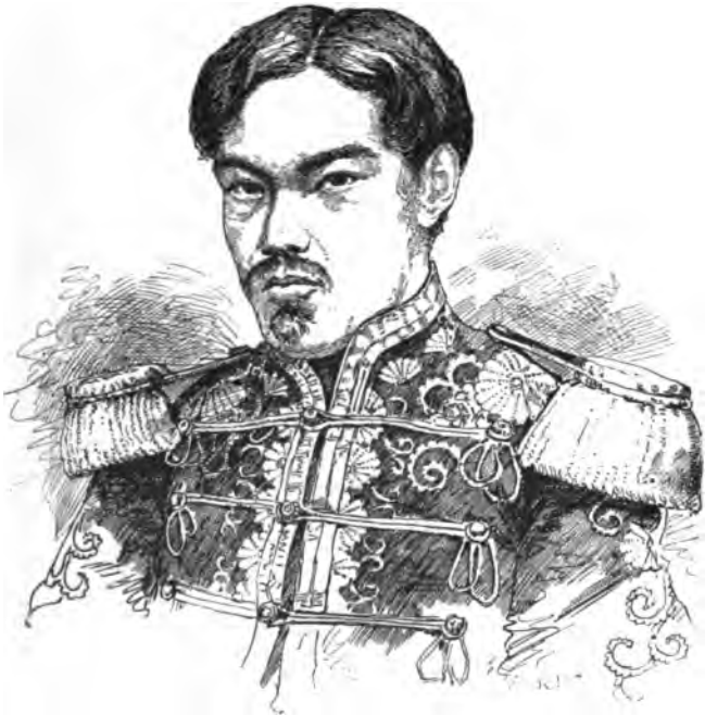
Emperor of Japan.